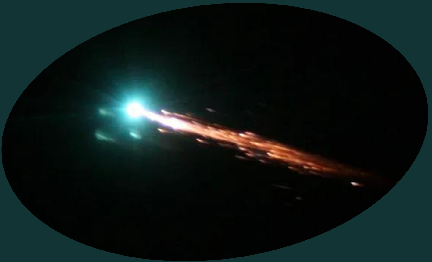
Figure 1. Re-entry of Jules Verne ATV over the Pacific Ocean. (ESA, 2008).

Spacecraft re-entry can look like beautiful shooting stars. However, recent studies found they don't only pollute land and water but also, the Earth's atmosphere.