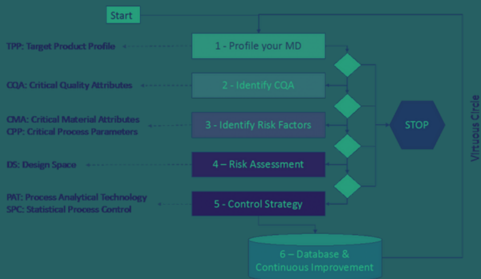
Figure 2. Quality by Design. (TBMED EU, 2020).

The initial version of the SSR eliminated elements related to assessing terrestrial pollution (e.g. material selection, ozone depletion, land/water contamination) due to their perceived complexity and contentiousness (Rathnasabapathy et al. 2019). Other related elements (e.g. acoustic suppression system assessment, greenhouse gas emissions, re-entry burn and plume) have also been excluded. However, several studies have been conducted that can be useful in estimating such terrestrial impact during pre-launch, launch, and post-launch (Wilson 2019; Suikkanen and Nissinen 2020; Antoniadou and Basubas et al. 2021; Ryan et al. 2022; Murphy et al. 2023; Shareefdeen and Al-Najjar 2024; Koffler 2024). Methods and frameworks, such as product environmental footprint (PEF) and life cycle sustainability assessments (LCSA), already exist. Still, implementation is still not widespread as it could be tedious to conduct such assessments for every mission.