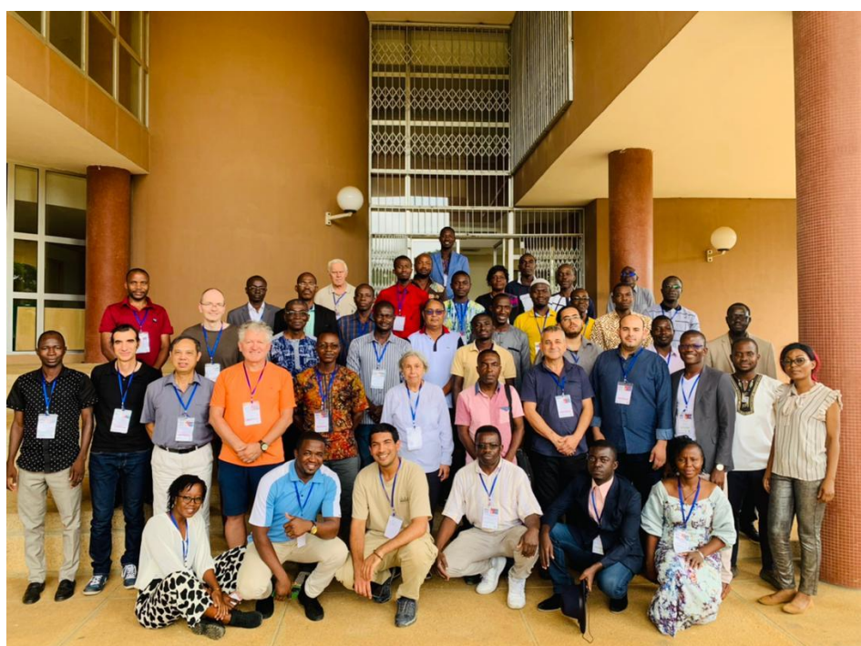
Group photo of school