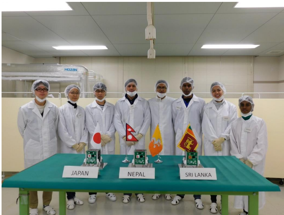
The BIRDS-3 team with the flight models

While taking the course, students are encouraged to get involved in hands-on satellite projects. I had joined the Bhutan satellite project too late to be part of the design stage, so, after this project was over, I sought out other projects where I could be involved in all phases of building a satellite. Next, I joined the BIRDS-3 project, that included the first satellites of Nepal and Sri Lanka. Here I was responsible for handling the power system, which is the very heart of a satellite and ensures uninterrupted power supply to the satellite from the beginning to the end of its life. My fellow participants in the project were from Sri Lanka, Nepal and Japan. The constellation of satellites was launched on April 17 th 2019 and deployed from the ISS on June 17 th 2019. The satellites have been operating flawlessly in space for more than a year now. Through the satellites, we have been taking pictures of different parts of the world and posting them on our official website ( https://birds3.birds-project.com/ ). We also obtained significant amount of in-orbit data that will be used to model the space environment for future satellite projects.