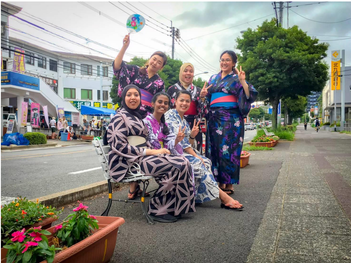
Pooja wearing Yukata with fellow students and friends.

Kyutech strives to have at least one woman in each fellowship intake. In the picture below, you can see fellow female students from Thailand, Malaysia, Egypt and Sri Lanka. In the BIRDS-2 and BIRDS-3 projects, we had three women in the team, and, out of the four team members who developed Bhutan's first satellite, two of us were women. I particularly encourage all fellow women aspiring to be space scientists and engineers to apply!