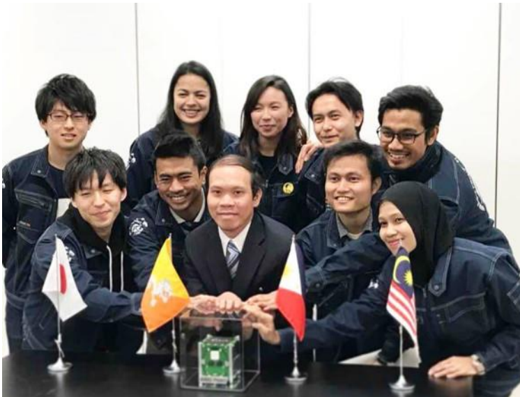
The BIRDS-2 team just before their satellites were delivered to JAXA

When I arrived at Kyutech in October 2017, the Bhutanese satellite was transitioning from engineering to flight model: when a satellite is in flight model, it means it is almost ready to be flown into space. I was so inspired by this project that I asked to join the team, becoming its fourth member from Bhutan. At the time they were doing the final testing and assembly and I was privileged to contribute to those tests and also to work on the ground sensors of the satellite, that enabled remote data collection after the launch. The satellite is a 1 unit cube satellite, with dimensions of 10x10x10 cm, and weighs just around 1kg.