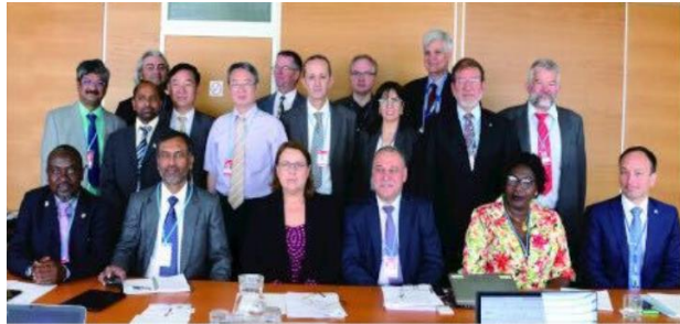
Meeting of the Directors, Jun 2017, Vienna, Austria